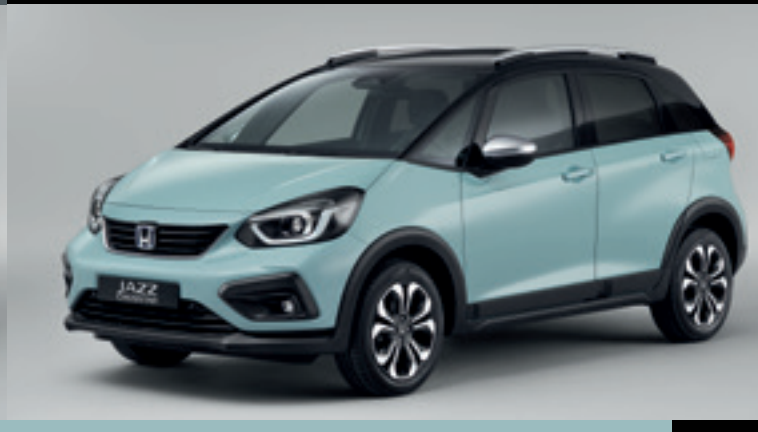
SURF BLUE / TWO-TONE