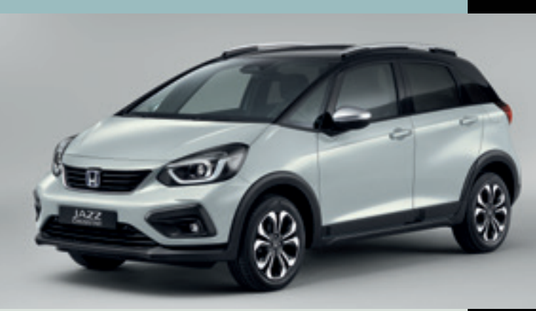
PREMIUM SUNLIGHT WHITE PEARL / TWO-TONE