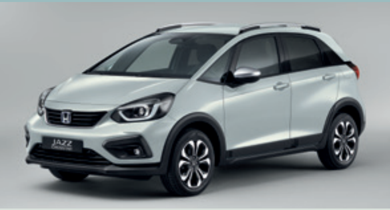
PREMIUM SUNLIGHT WHITE PEARL