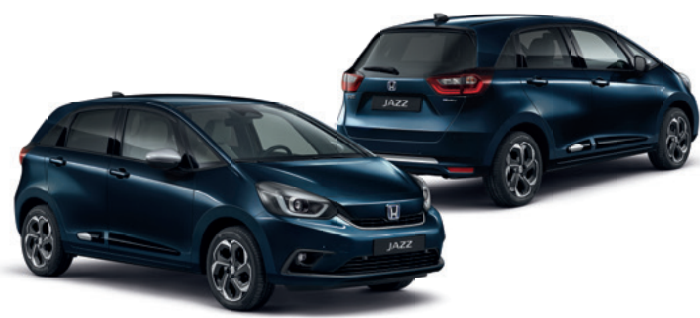
Image shows optional 16" JA1601 alloy wheels, applicable only on the EX grade

Dare to be unique and make your new Jazz stand out by adding tasteful colour touches on both the exterior and interior, complementing the cars dynamic design. The pack includes: a Front Grille, two Door Mirror Covers, Side Body Trims with Tuscan Orange Colour Inserts, a Rear Bumper Decoration and a set of Elegance Floor Mats. The Functional Fun pack is also available in Piano White.