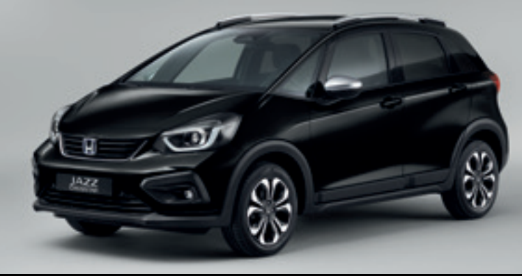
CRYSTAL BLACK PEARL