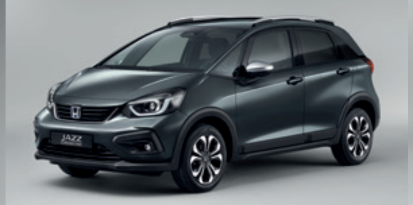
SHINING GRAY METALLIC